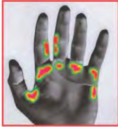
Without soft-grip coating: extreme pressure points