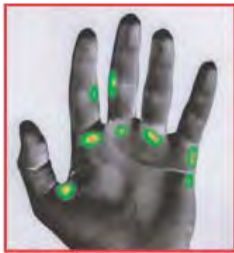
With soft-grip coating: reduced pressure points