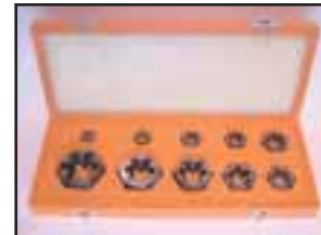
1/4"-1" 10 PC Sets