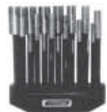
Blind Hole Set