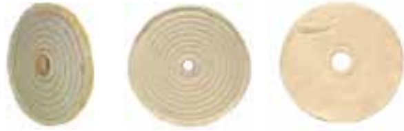
Sisal Spiral Loose

Sisal: With cloth covers spiral stitched for heavy cut down steel and stainless steel.