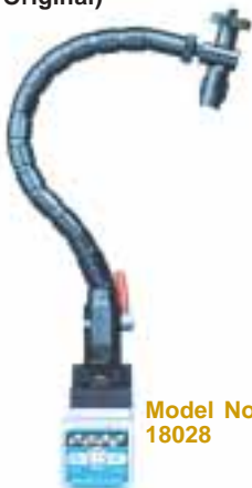
Model No. 18028

Instant Positioning--Instant Locking Universal Holders/Positioners For AGD Indicators and Electronic Sensors (Lug Backs Too)