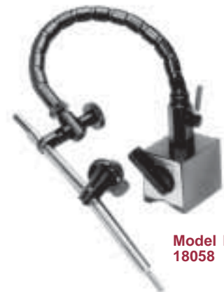
Model No. 18058