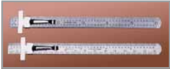
Round end rules with depth gage pocket clip.