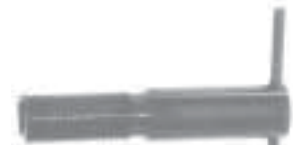
Type 3 - Installation Tool (Threaded Mandrel)