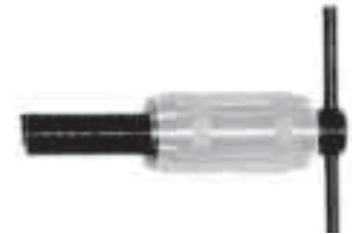
Type 4 - Non-Captive Prewinder