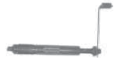
Type 2 - Hand Inserting Tool (Prewinder Tool)