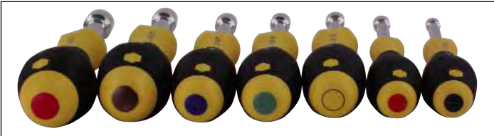
Inch Color Coded To Size